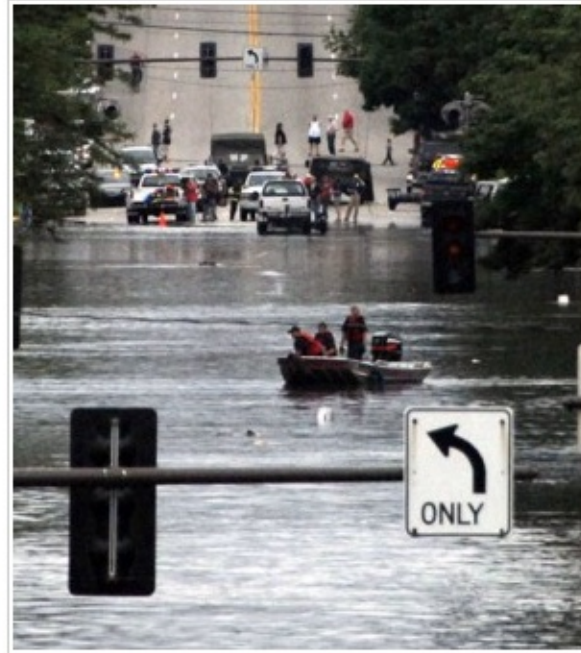
Image: Floods in Cedar Rapids, Iowa in 2008

Special flood maps for select communities are included in the tool: Ames, Cedar Rapids and Des Moines are just a few. The maps are meant to help avoid future flood damage after Iowans sustained more than $1 billion in losses during 2008 flooding.